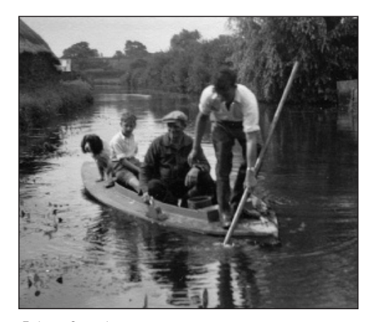
Fishing for eels.