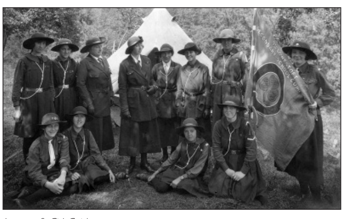
Lowestoft Girl Guides.